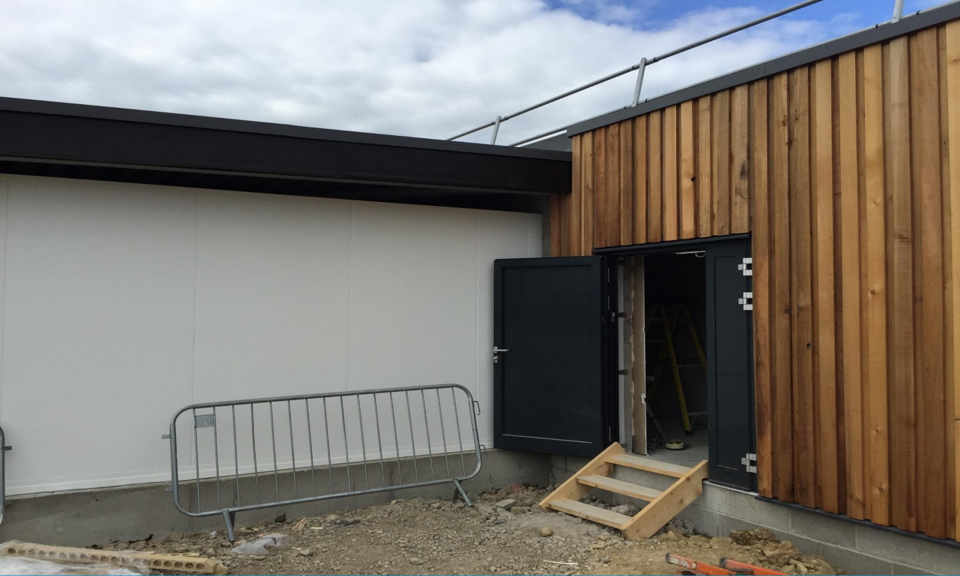
Back elevation with door installed and fridge carcassing to the left ...